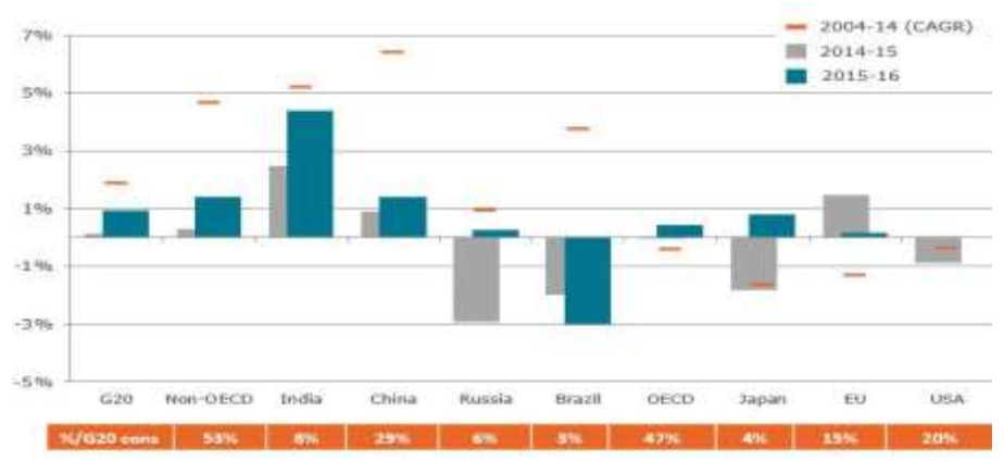
Fig.1 Growth in Energy Consumption for G20 Countries